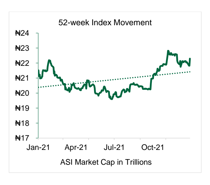
Figure 1: ASI Market Capitalization movement Jan to Dec 2021